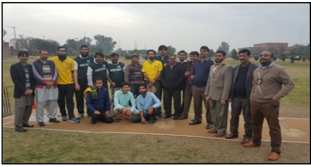
The Physics department secured over all 4th position in Fall 2016 sports.