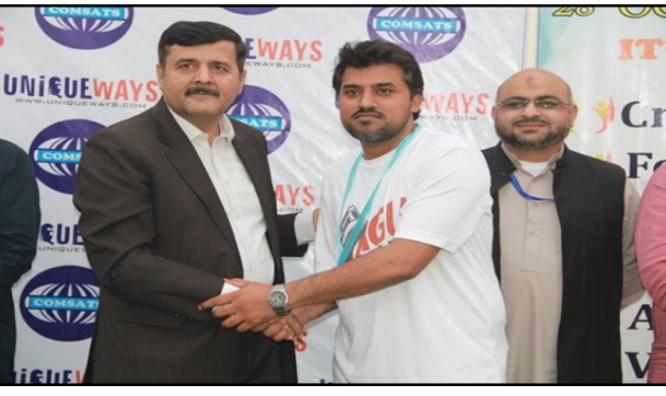
Along with sports activity in sports week, department of physics has also arranged Physics Super League in departmental level in which students of physics get opportunity to enjoy cricket along with their studies. Here are some glimpses of Physics super leagues 2.