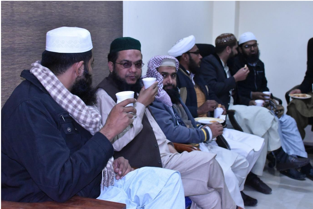
Tea and Lunch was served to the participants on both days of workshop.