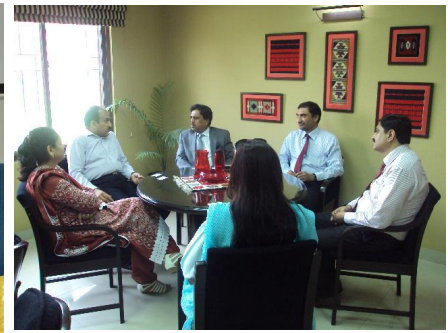
Chief Guest meeting with director CIIT Lahore

served with Brunch, Lunch and HiTea. The event was given media coverage by PTV and City 42.