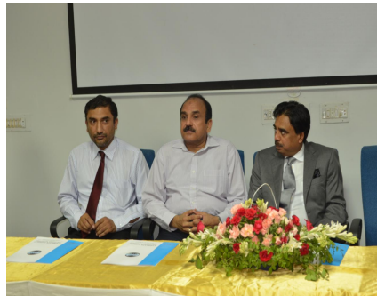
Chief Guest, Director CIIT Lahore and HOD CS CIIT Lahore