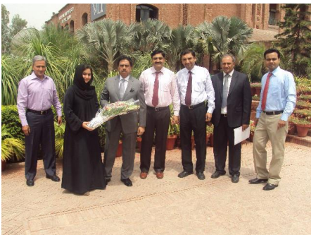
Chief Guest with COMSPEC team