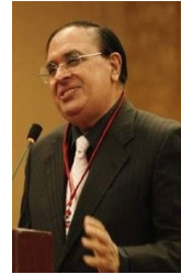
Founder of HEC— Dr. Ata-ur-Rehman