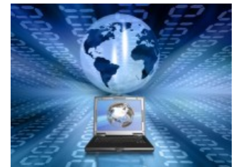
Global computerized world