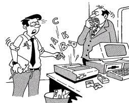
“The Printer ran out of paper again”