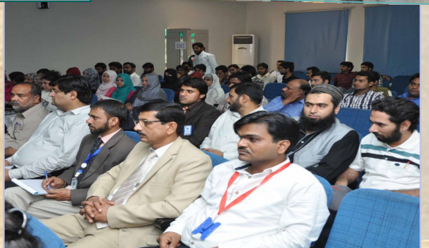
All Speakers and guests also enjoyed the sumptuous tea and lunch during the ceremony.